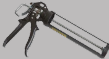
Adhesive applicator gun