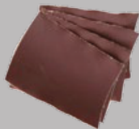
Fine grain abrasive paper