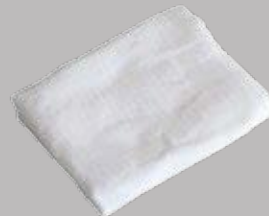
Cotton waste (Cloth)