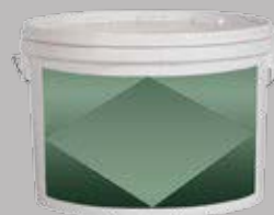
Fine grain water-soluble filler