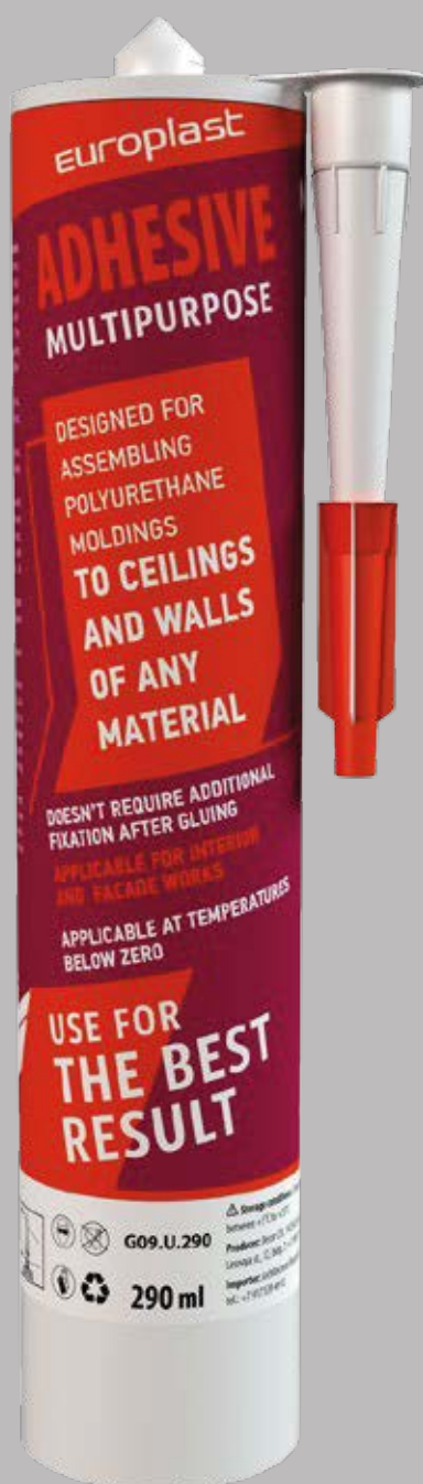
MULTIPURPOSE ADHESIVE 290 ml