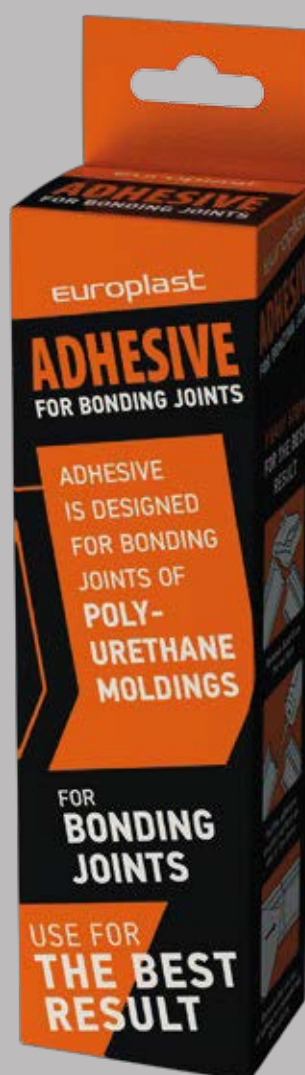
ADHESIVE FOR BONDING JOINTS 60 ml

The following information is relevant for ProfHome® Adhesives. If you use other adhesives, follow manuals on it's package.