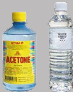
Acetone. White spirit