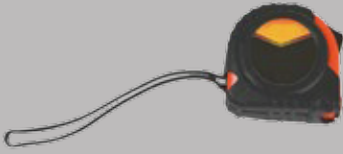
Spring tape measure